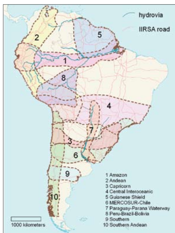
Figure 1.1. IIRSA is composed of ten hubs that incorporate investments in modern paved highways, railroads, waterways, and grids. The upgraded road networks will span the Amazon, while waterways (hydrovias in IIRSA terminology) will open up vast areas of the western Amazon to commerce and development (map modified from IDB 2006).

IIRSA involves all the countries of South America and was created to promote growth and development by investing in the physical integration of three strategic economic sectors: transportation, energy, and telecommunications. Although IIRSA is not a free trade agreement, it addresses regulatory issues that are barriers to the economic and social exchange among the nations. IIRSA promotes common industrial standards and communication protocols, while facilitating border crossings for rail, maritime, and airline transport. IIRSA also sponsors meetings and studies to promote commerce, and it facilitates technological exchange, integration of markets, and standardization of regulations (IDB 2006). However, IIRSA's most important investments are focused on improving the physical infrastructure of transportation. IIRSA projects are organized within one of ten integration hubs ( ejes in Spanish and eixos in Portuguese), each with several corridors composed of highways, hydrovias, 1 and railroads, as well as electrical grids and pipelines (Figure 1.1). IIRSA is not a funding agency; rather, it is a coordinating mechanism among the governments and the multilateral institutions that are responsible for financing most of the public works investments in South America. IIRSA is governed by an Executive Steering Committee (CDE) and a Technical Coordinating Committee (CCT). The CDE