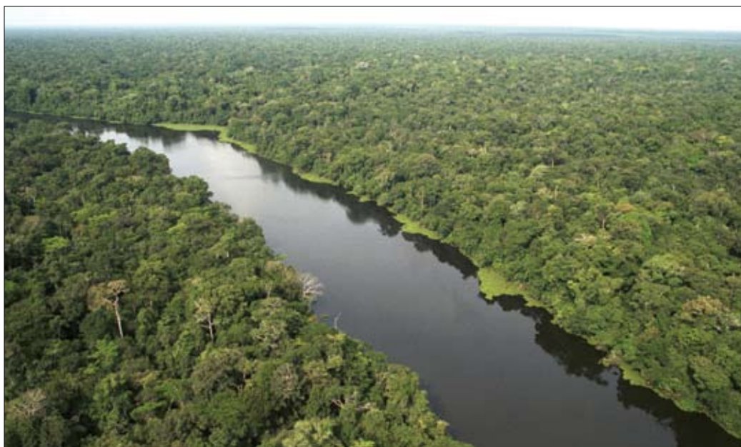
Figure 1.6. A Utopian Scenario would require an international agreement that compensates Amazonian countries for reducing carbon emissions caused by deforestation. Payments for ecosystem services would be used to fund health and education, and to subsidize production that avoids deforestation and forest degradation.