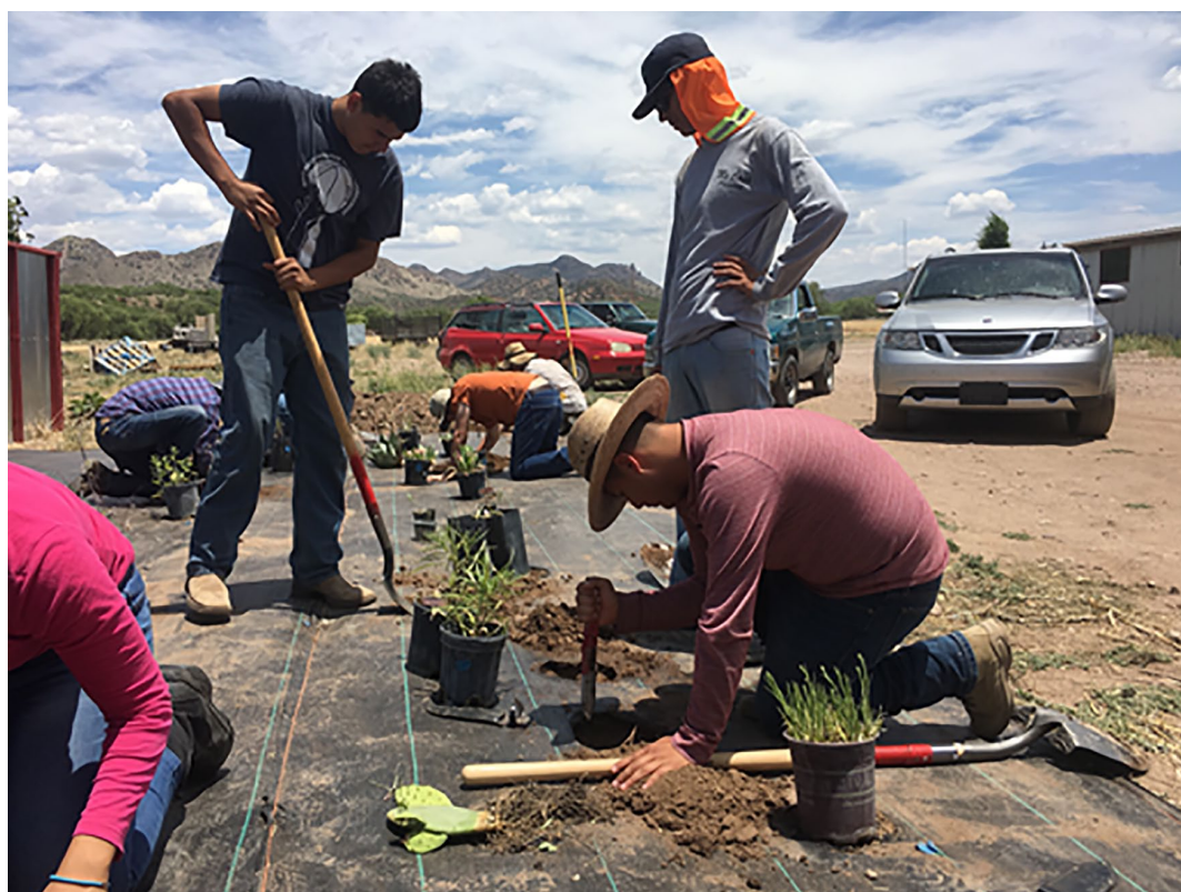
Image 5. BECY crew planting native flowers at Patagonia Flower Farm.