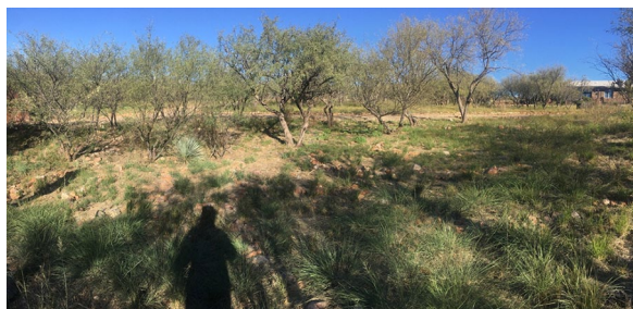
Image 9. Fishscale structure built on eroding slope, 1 year later. Grasses have returned and rocks are barely visible.

School staff to pilot an after-school program that hired Tohono O'odham students to work alongside conservation professionals, designing and installing a rainwater-harvesting native plant and heritage food garden on campus. This program, called Şu:daḡi 'O Wuḡ Doakag, O'odham for "Water is Life," was designed for Tohono O'odham youth to earn valuable skills, training, and work experience. During the 2018/2019 pilot program, youth worked hard to improve their campus, build habitat for native pollinators, harvest precious rainwater, and sow seeds of hope for future generations of youth. Participants were presented the Stewardship Award at the annual Tohono O'odham Earth Day festival hosted by the Tohono O'odham Environmental Protection Office. A second year of Şu:daḡi 'O Wuḡ Doakag began in the fall of 2020, led by Tohono O'odham Community College students with mentorship and curriculum development by BRN staff. And simultaneously, BRN has been approached about developing youth restoration programming in the Mexican border city of Agua Prieta, Sonora. Along with healing landscapes, restoration can heal cultural relationships.