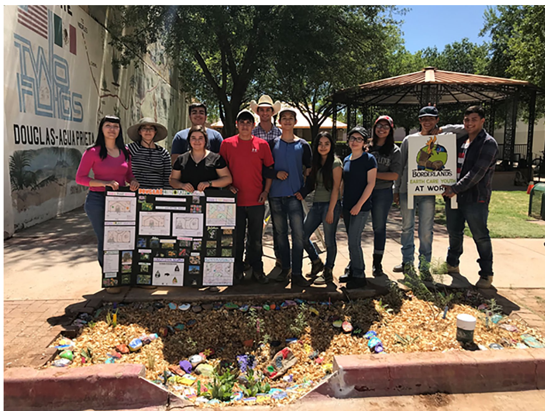
Image 3. BECY crew at infiltration basin in Douglas, Arizona.