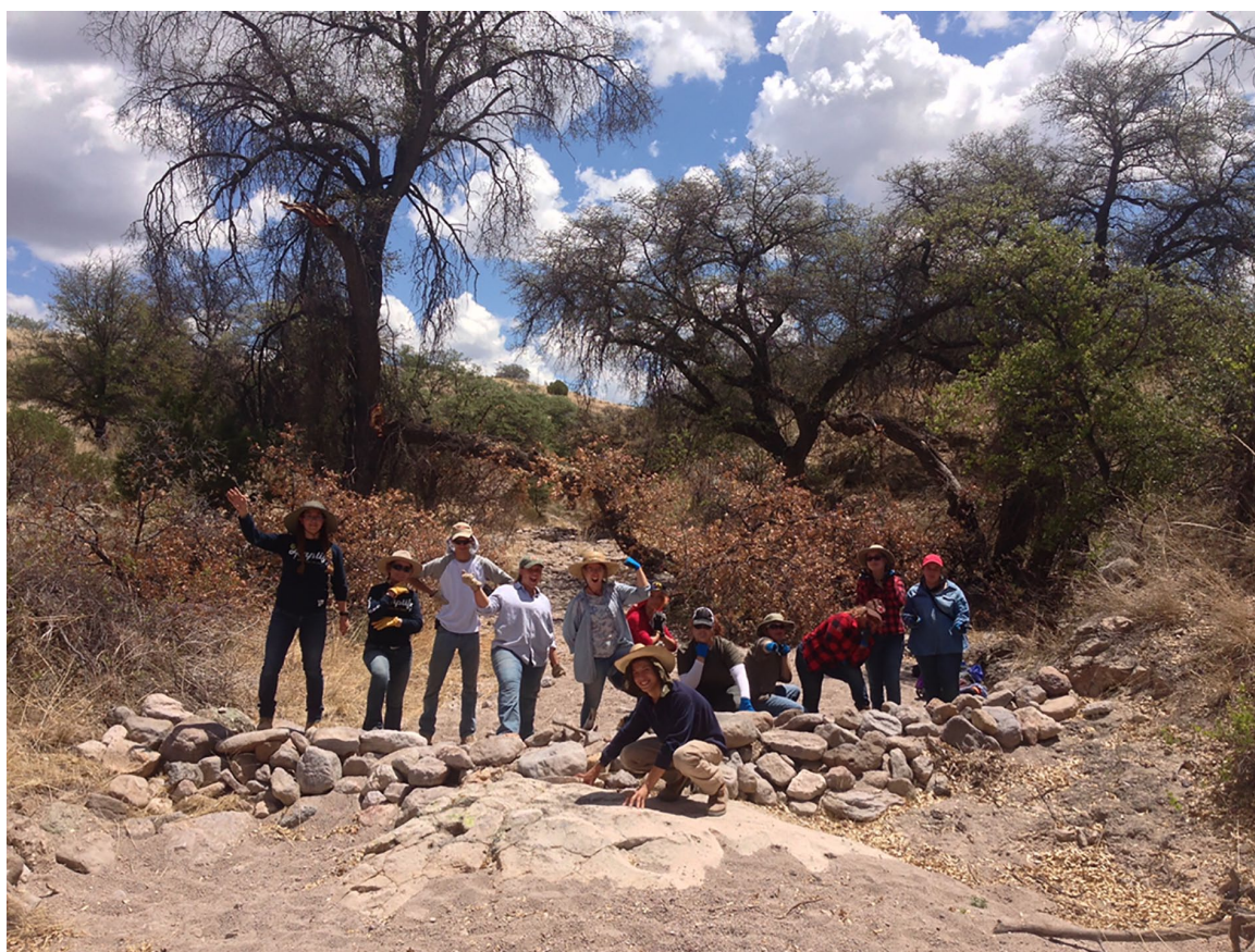
Image 1. BECY crew with rock structure.