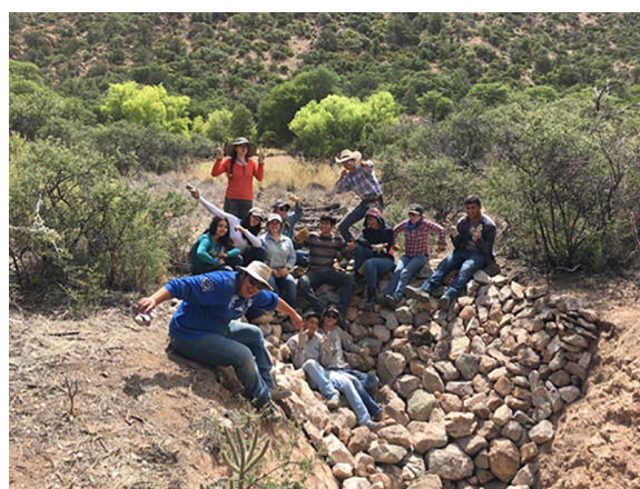
Image 7. BECY with giant Zuni bowl in Dragoon Mountains of Arizona.