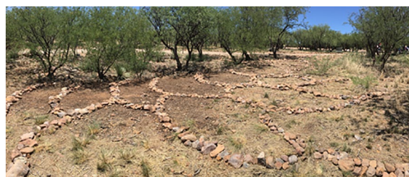
Image 8. Before image of Fishscale structure built on eroding slope.

In 2018, representatives from Baboquivari High School, Tohono O'odham Community College, and the Tohono O'odham Nation—a desert Indigenous community located along what is today known as the U.S./Mexico border—visited