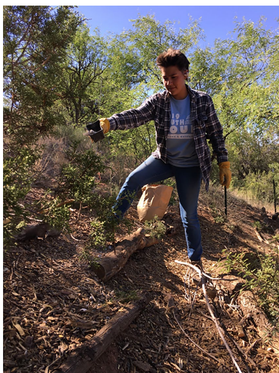
Image 6. BECY crew casts grass seeds on private ranch.