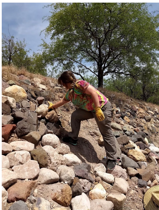
Image 2. BECY team member with rock structure.

During the summer of 2019, BECY Institute celebrated the eighth year of programming. Since it began, BECY interns have built more than 2,000 erosion control structures across three