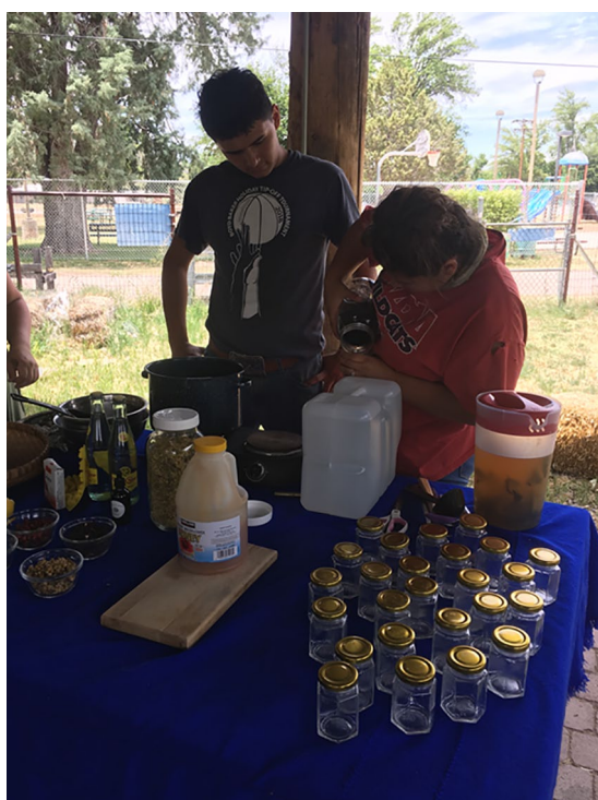
Image 4. BECY crew making immune-boosting elderberry syrup.

And BECY graduates in Douglas are now pursuing livelihoods in land conservation and restoration.